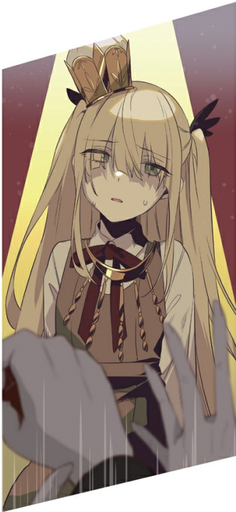
code name FOOL