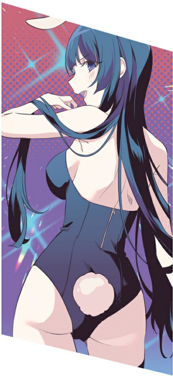
code name DREAMSPEAKER