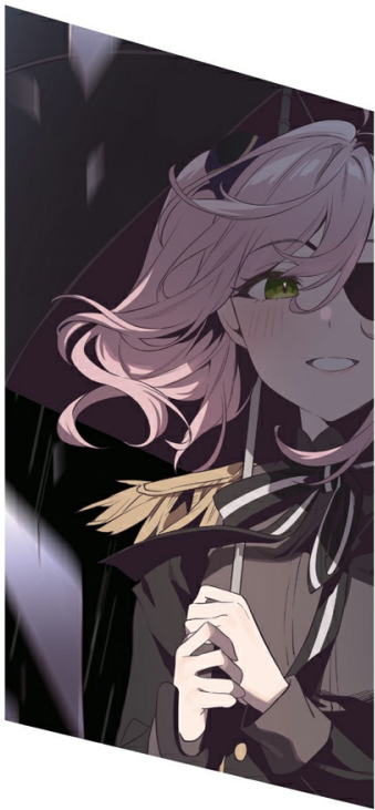
code name FORGETTER