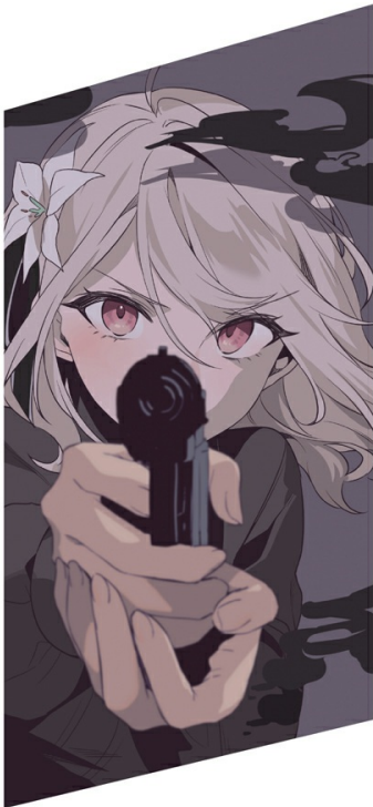
code name FLOWER GARDEN